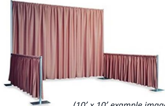
(10' x 10' example image)

*if you are a Corporate Sponsor, contact us for your discounted rate