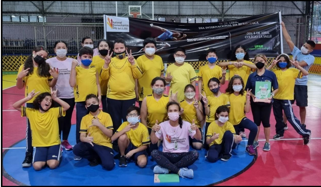
Brazil and...well, Brazil